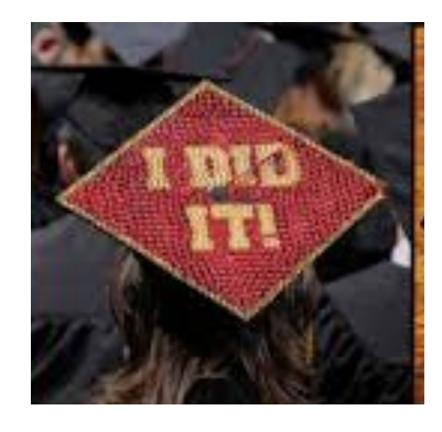
Scan Code above to order a Cap & Gown if you have not ordered